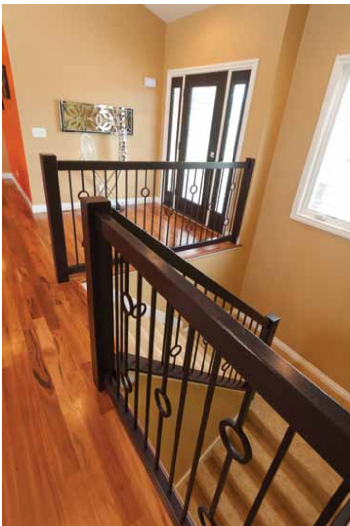
ABOVE LEFT: Modern flare is carried throughout the home with fabrics and accessory selections.