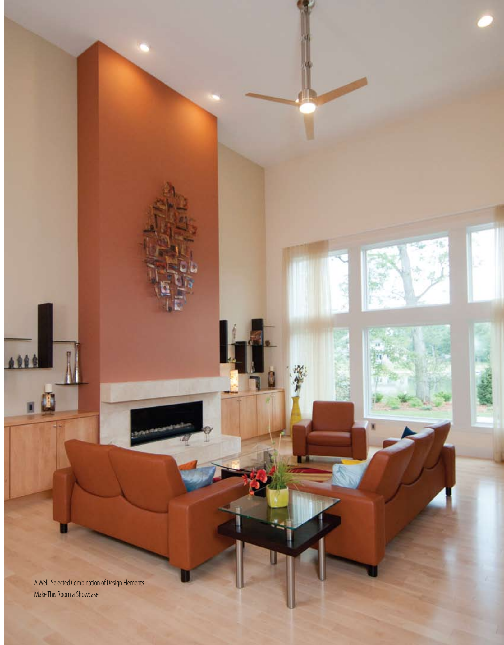
A Well-Selected Combination of Design Elements Make This Room a Showcase.