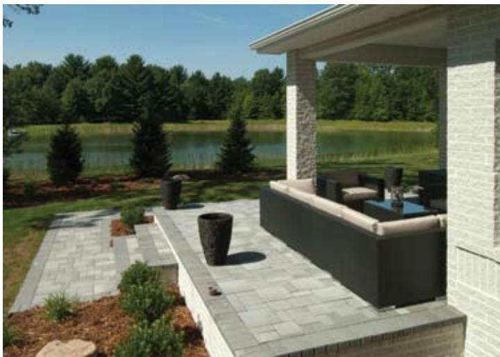
ABOVE: The covered veranda beckons all.