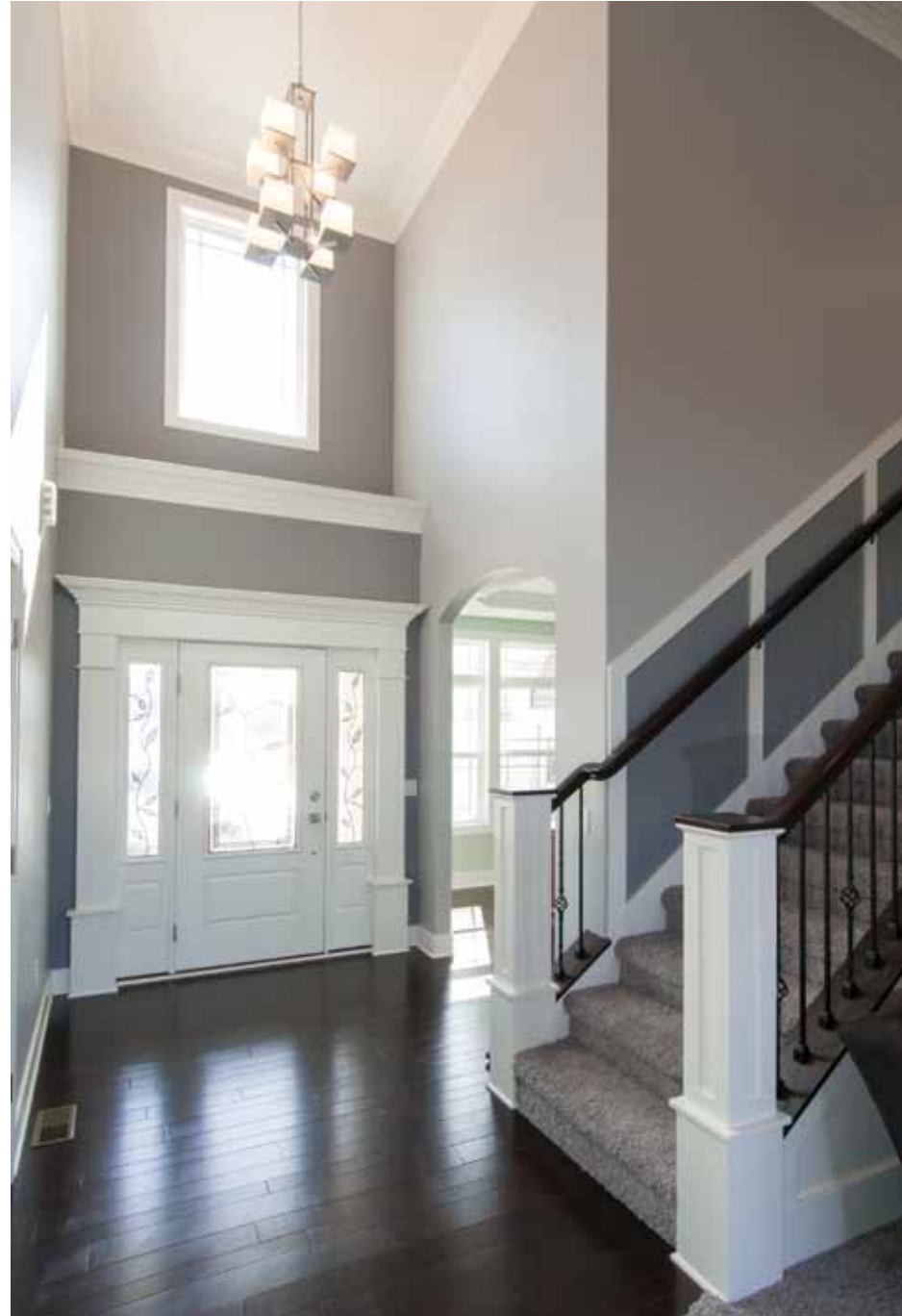
Entry Chelsea Plank Flooring (made in Chelsea, Michigan) - Oxford Ash