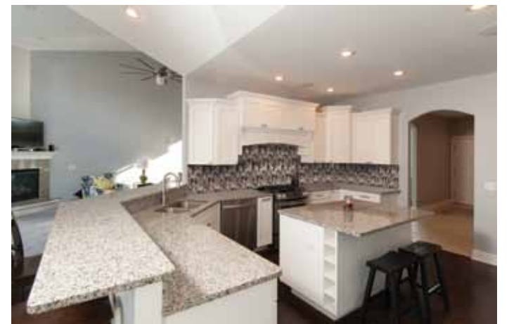
Kitchen Mid Continental Cabinets - White with Black Glaze