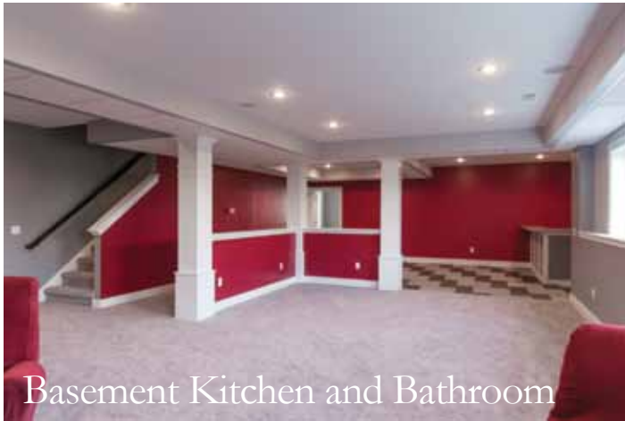
Basement Kitchen and Bathroom